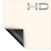
HD Progressive 1.1 Half Angle: 85° Gain: 1.1