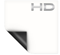
HD Progressive 1.3 Half Angle: 75° Gain: 1.3