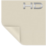
Dual Vision Half Angle: 65° Gain: 0.9