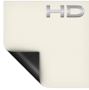
HD Progressive 0.9 Half Angle: 85° Gain: 0.9