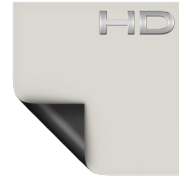
HD Progressive 1.1 Contrast Half Angle: 60° Gain: 1.1