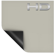
HD Progressive 0.6 Half Angle: 85° Gain: 0.6