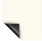
HD Progressive 1.1 Half Angle: 85° Gain: 1.1