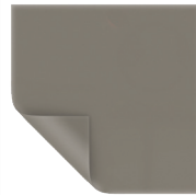
Da-Tex Half Angle: 30° Gain: 1.3

NOTE: HD Progressive and Parallax® Stratos screen surfaces available on Tensioned Cosmopolitan (over 12' W). See the Tensioned Contour Series for smaller sizes featuring these surfaces.