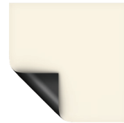
HD Progressive 1.1 Contrast Half Angle: 60° Gain: 1.1