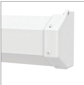
White Case (Standard Profile)