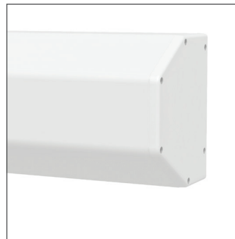
White Case Profile (Standard) - Sizes over 12' W