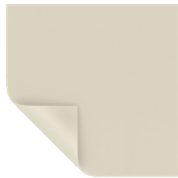
Dual Vision Half Angle: 65° Gain: 0.9