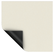
Da-Mat Half Angle: 60° Gain: 1.0