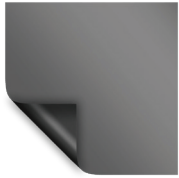
Parallax Stratos 1.0 Horizontal Half Angle: 30° Vertical Half Angle: 30° Gain: 1.0