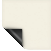
HD Progressive 0.9 Half Angle: 85° Gain: 0.9