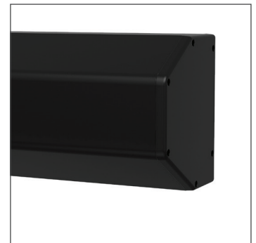
Black Case Profile - Sizes over 12' W