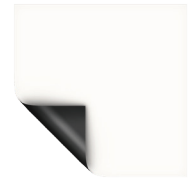
HD Progressive 1.3 Half Angle: 75° Gain: 1.3