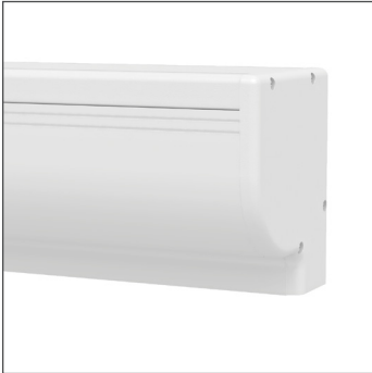
White Case (Standard)