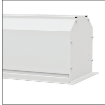
Case Profile - Sizes Over 14' W