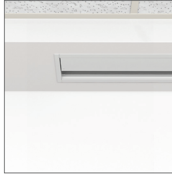
In Ceiling (Closed)