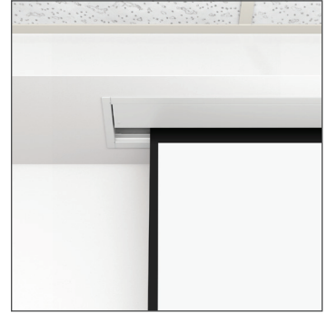
In Ceiling (Open)