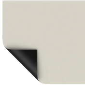
High Contrast Matte White*