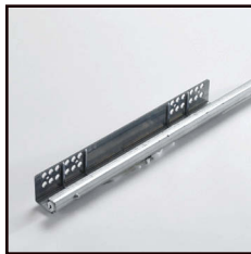
Ball bearing full extension glide