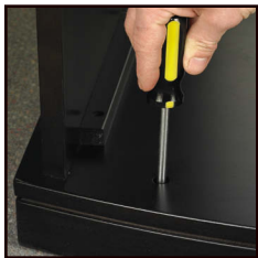
Inside leveler for easy adjustment