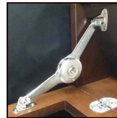
Flap stay opening system