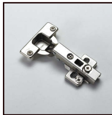
3 way adjustable hinge